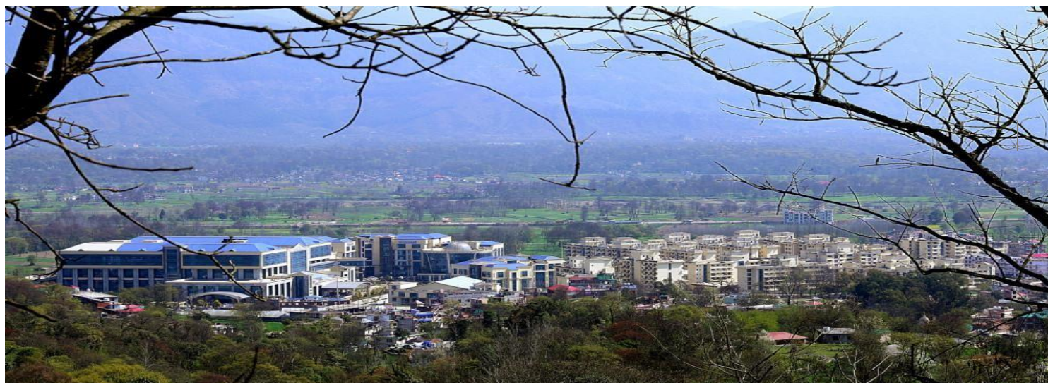
A View of Shri Lal Bahadur Govt. Medical College & Hospital, Nerchowk, Distt. Mandi (HP)