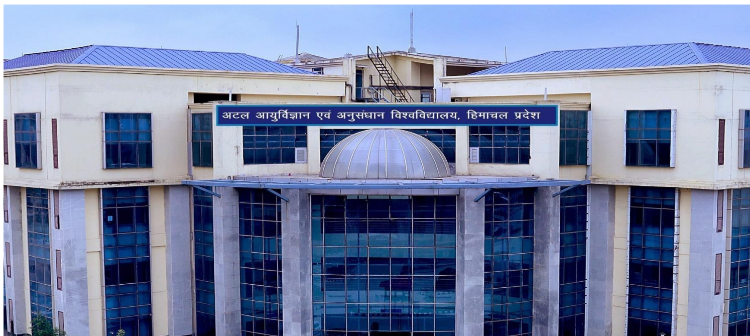
A View of Atal Medical And Research University, HP, Nerchowk, Distt. Mandi