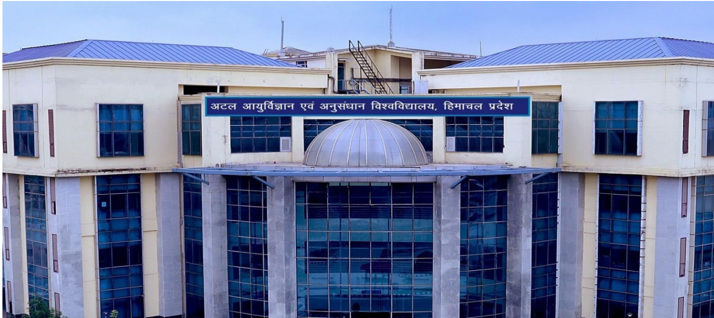
A VIEW OF ATAL MEDICAL & RESEARCH UNIVERSITY, HP At NERCHOWK, DISTT. MANDI