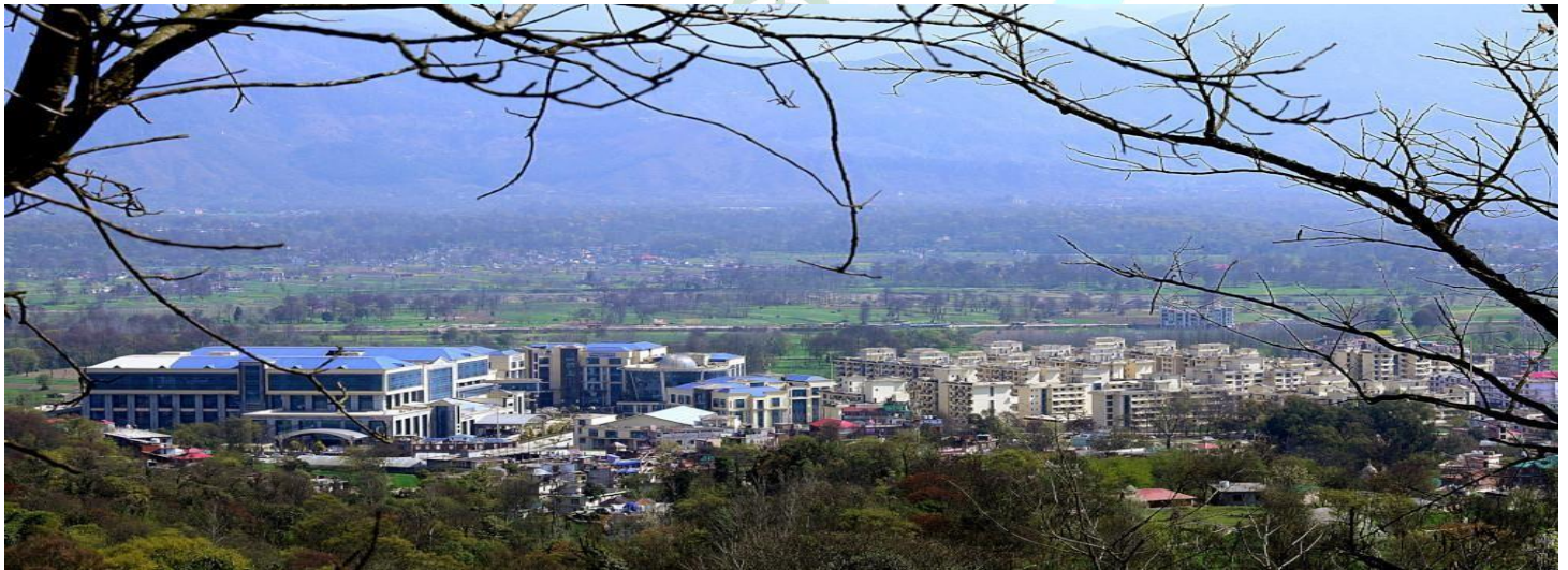
A VIEW OF SHRI LAL BAHADUR SHASTRI GOVT. MEDICAL COLLEGE & HOSPITAL, At NERCHOWK, DISTT. MANDI, HP