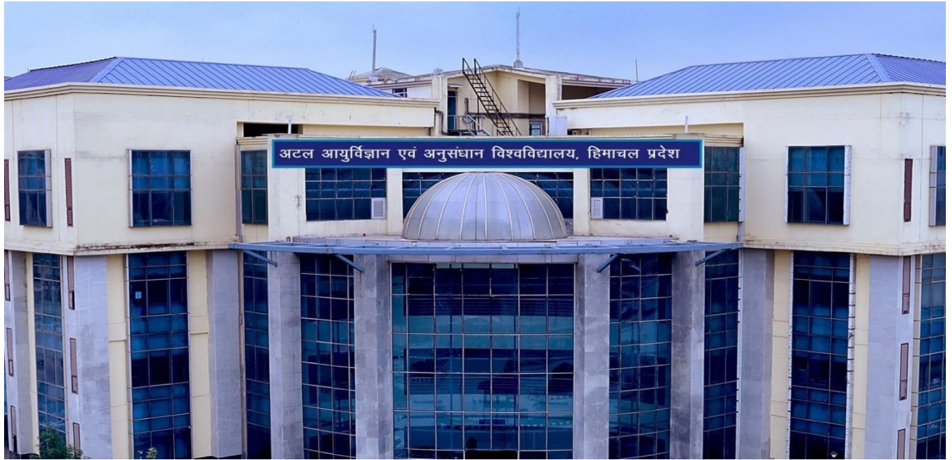
A View of Atal Medical & Research University, HP, Nerchowk, Distt. Mandi