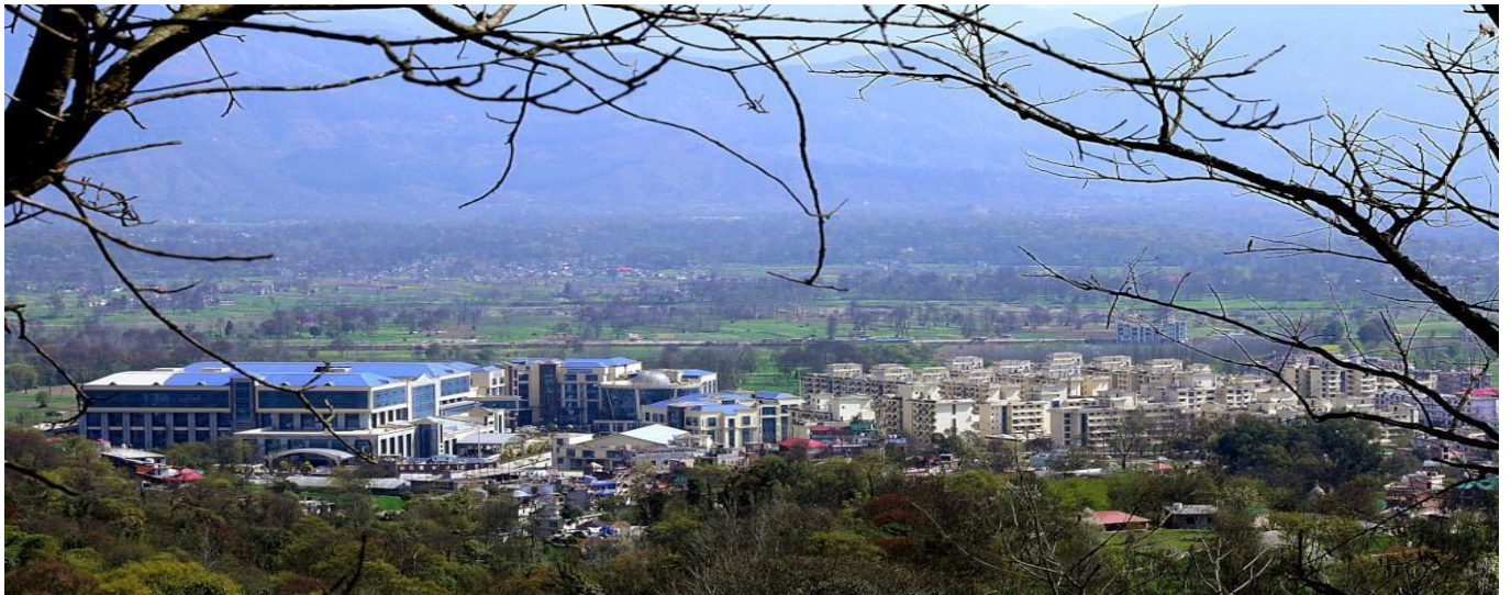
A View of Shri Lal Bahadur Govt. Medical College & Hospital, Nerchowk, Distt. Mandi (HP)